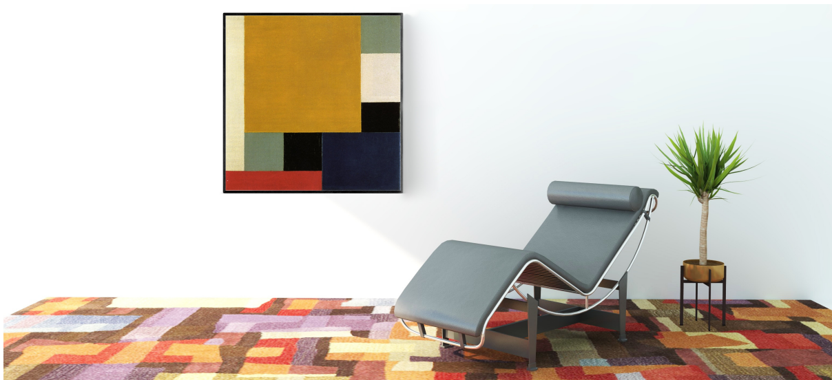
Figure C.1: A test subject for the frame.

You will be responsible for buying the filament to run around the entire perimeter of the artwork. How many centimetres will you need to obtain?