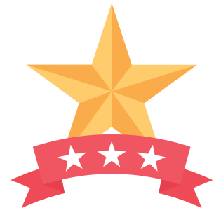
The streak badge that Greg shoots for (designed by VectorsMarket from Flaticon).

Given the days when Greg actually practiced his Swedish and the number of days he is willing to pay for, what is the longest streak he can reach?