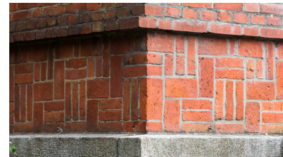
An interesting brick layout