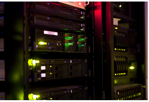
Claus Rebler, cc-by-sa

You're investigating what happened when one of your computer systems recently broke down. So far you've concluded that the system was overloaded; it looks like it couldn't handle the hailstorm of incoming requests. Since the incident, you have had ample opportunity to add more servers to your system, which would make it capable of handling more concurrent requests. However, you've simply been too lazy to do it—until now. Indeed, you shall add all the necessary servers ... very soon!