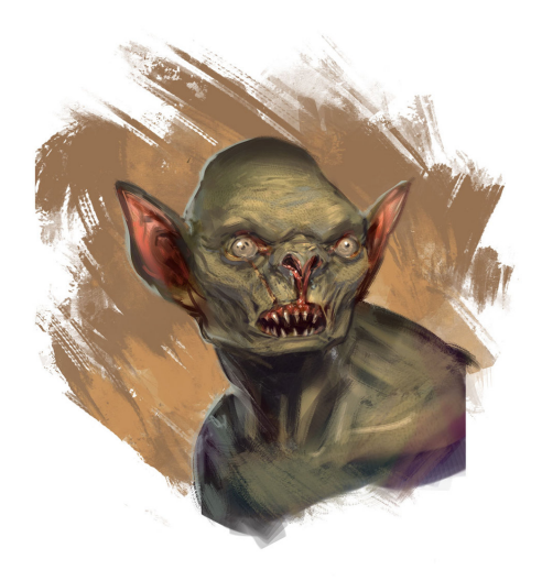
Felipe Escobar Bravo, cc-by-nc-nd

Thankfully, the garden is equipped with an automated sprinkler system. Enabling the sprinklers will soak all goblins within range, forcing them to run home and dry themselves.