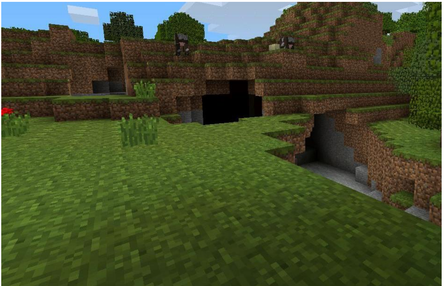
Figure 1: A typical world in Minecraft.

Have you ever played the video game Minecraft? This game has been one of the world's most popular game in recent years. The world of Minecraft is made up of lots of 1 \times 1 \times 1 blocks in a 3D map. Blocks are the basic units of structure in Minecraft, there are many types of blocks. A block can either be a clay, dirt, water, wood, air, ... or even a building material such as brick or concrete in this game.