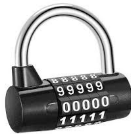
A 5-digit combination lock

Once there was a combination lock, which consisted of m rings with digits from 0 to 9. It was broken so one could never open the lock no matter how he spun it. Alice and Bob wanted to play a game with it. They in turn spun one ring of the lock for one step in either direction, and tried to open the lock (although they knew the lock would never open). If the password on the lock had already been tried, the player would be considered lost. Additionally, they had discussed a set S of n passwords before the game started. The player would also lose if (s)he tried a password among S . Alice would move first.